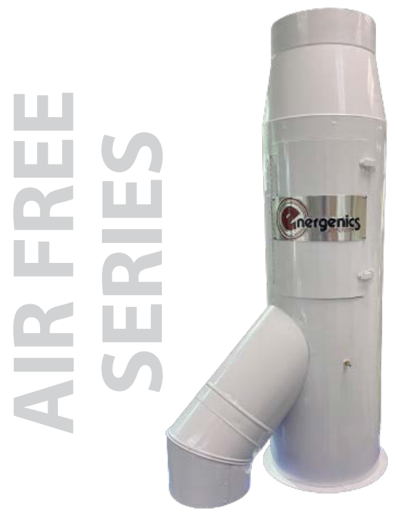
In-Duct AF-S Filter (self cleaning model)