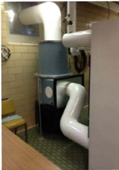
AF-2 (STD) INTERIOR INSTALL