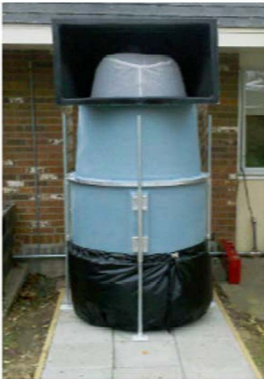
AF-7 (STD) EXTERIOR INSTALL

PREVENT EQUIPMENT DAMAGE, UNSIGHTLY MESS, AND POTENTIAL FIRE FROM EXCESSIVE LINT BYPASS