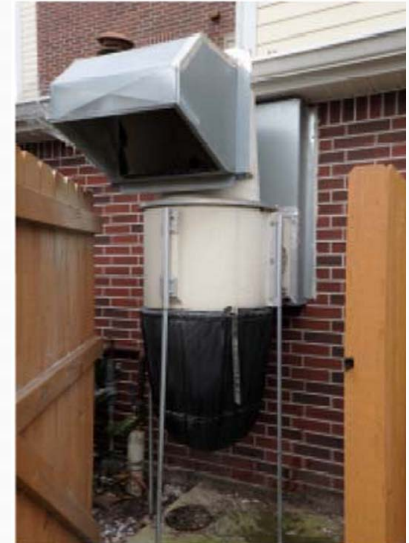
AF-3 (STD) EXTERIOR INSTALL

This versatile lint filter has evolved from more than 30 years of research and development to be the optimum solution for capturing bypassed lint produced by OPL textile dryers.