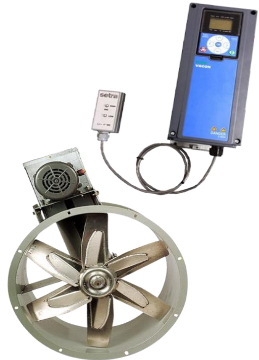
Variable Frequency Drive, Fan, & Transducer