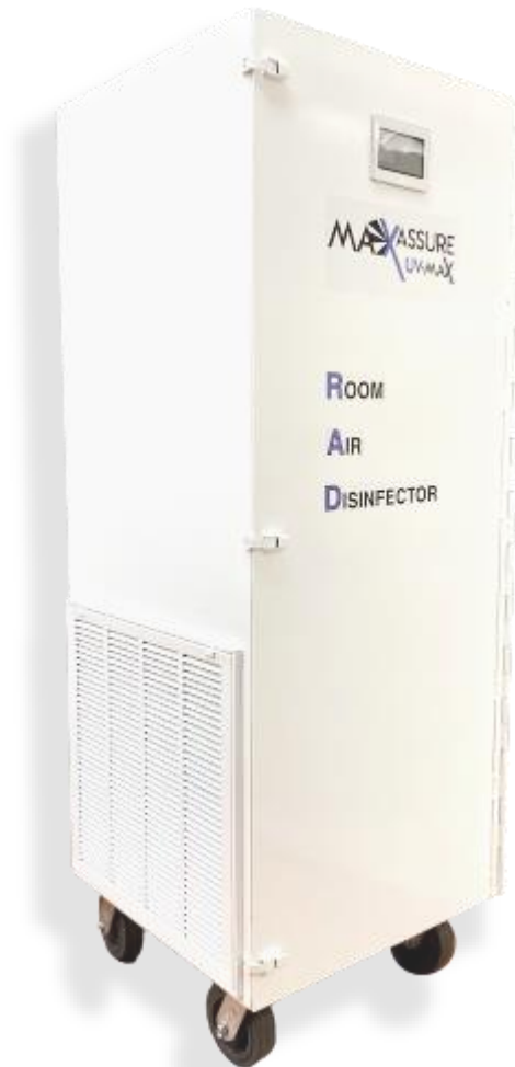
*For use in occupied areas!

99.999% Demonstrated reduction of microorganisms more resistant to disinfectants than SARS-CoV-2 (Covid-19).