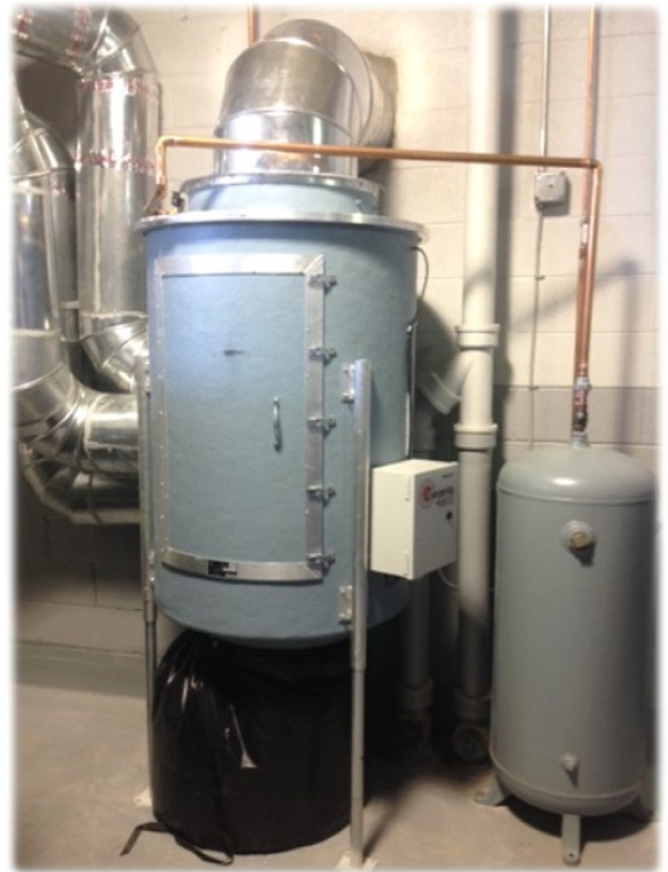
FRP filter w/ optional radius inspection door and compressed air storage tank