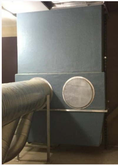
AF-10 (FM) INTERIOR INSTALL