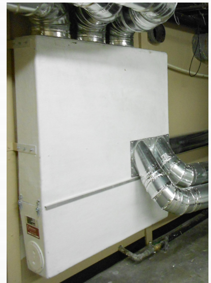
AF-4 (FM) INTERIOR INSTALL

This versatile lint filter has evolved from more than 30 years of research and development to be the optimum solution for capturing bypassed lint produced by OPL textile dryers.