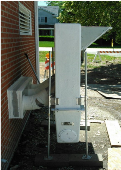
AF-4 (FM) EXTERIOR INSTALL

PREVENT EQUIPMENT DAMAGE, UNSIGHTLY MESS, AND POTENTIAL FIRE FROM EXCESSIVE LINT BYPASS