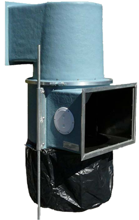
Image: AF-3 Multi-Dryer w/ Side Discharge